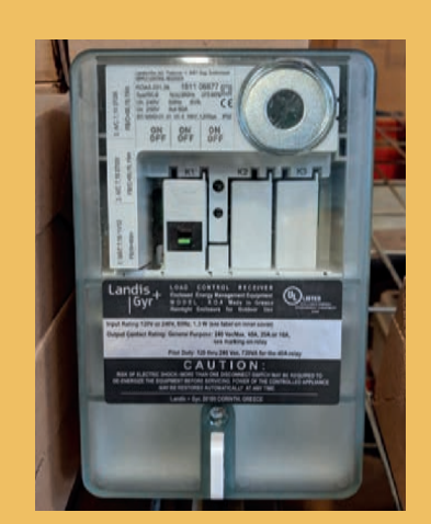
This is an example of a load management receiver. It is required for certain rates and rebates on water heaters, air conditioners and irrigation systems. Installation of new receivers will begin in 2024.

Our load management system allows your cooperative to minimize wholesale power costs by lowering power purchases during peak times. The current system was installed in the 1980s and plans are underway to replace it with newer technology.