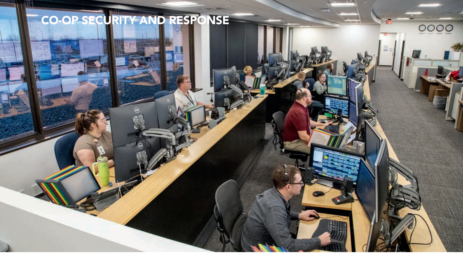
Basin Electric Security and Response Services dispatchers take calls from rural electric cooperative members at Basin's headquarters in Bismarck, N.D.