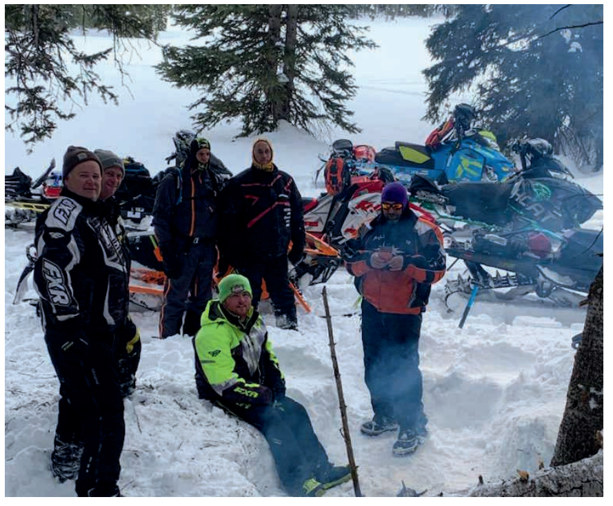
Watertown's South Dakota Snowmobile Club members take a break during an outing.

More information on the state's snowmobile clubs can be found at the SDSA's website at snowmobilesd.com.